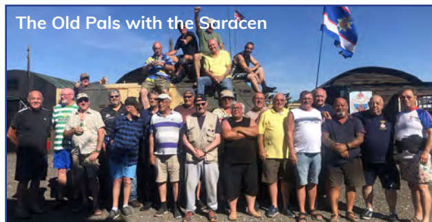
The Old Pals with the Saracen