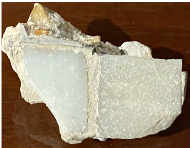
A very small piece of Buller Barracks