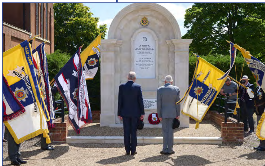
Corps Sunday Act of Remembrance

to accelerate the process of further convergence. That said, your Council believes that it would be prudent to have agreed arrangements in place well in advance of when they may be required. I am confident that all our members would support such an approach which has the clear objective of ensuring that members continue to receive the support they need and for as long as they need it. We will of course keep you informed of development in future additions of the Waggoner.